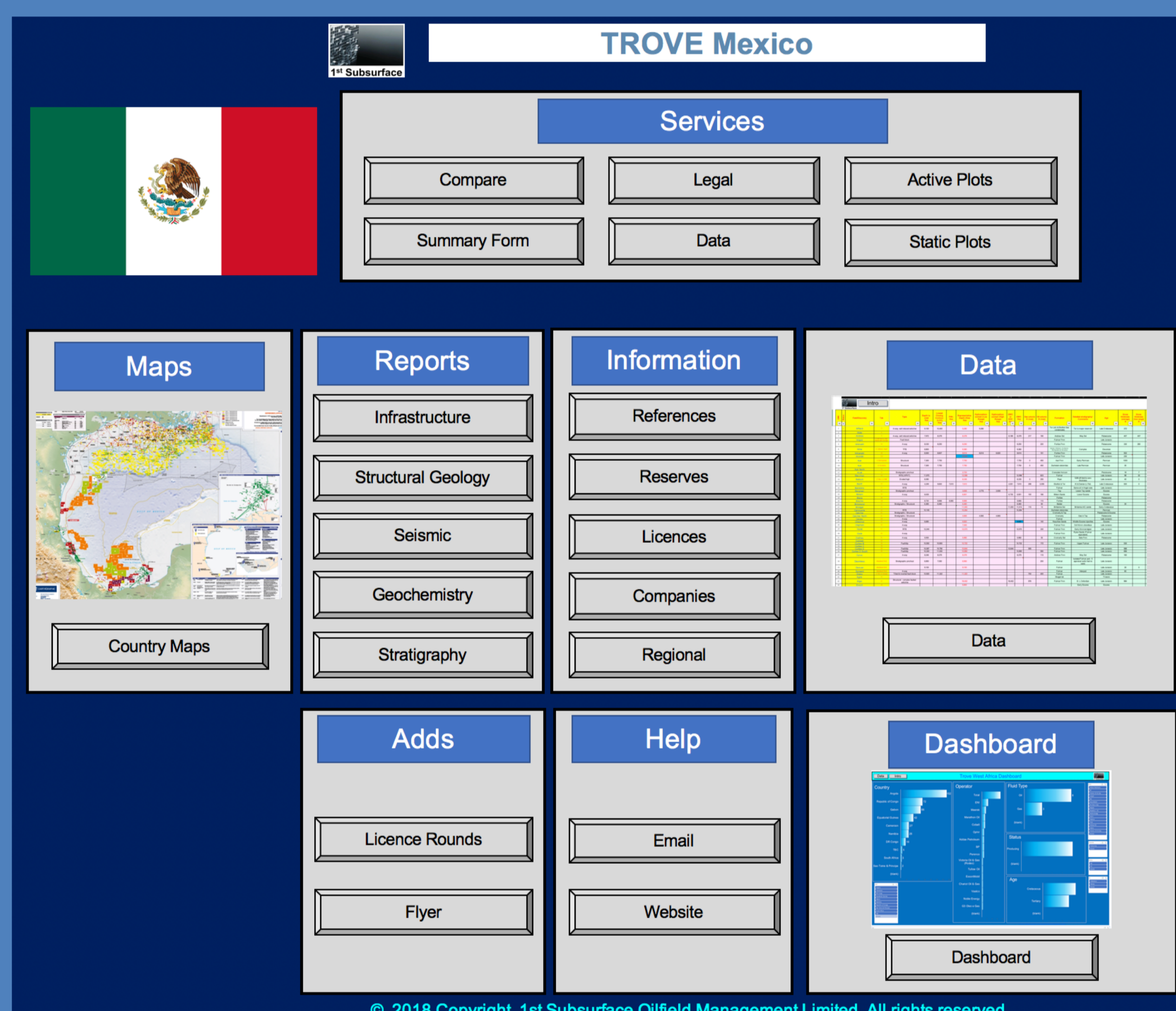
TROVE Interface – tailored to each database